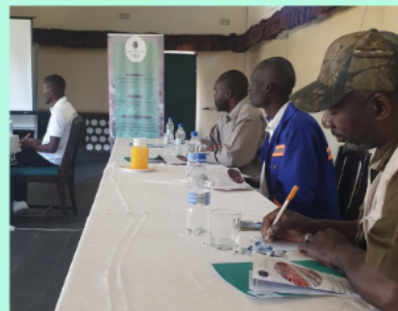
Raising Animal welfare standards workshops