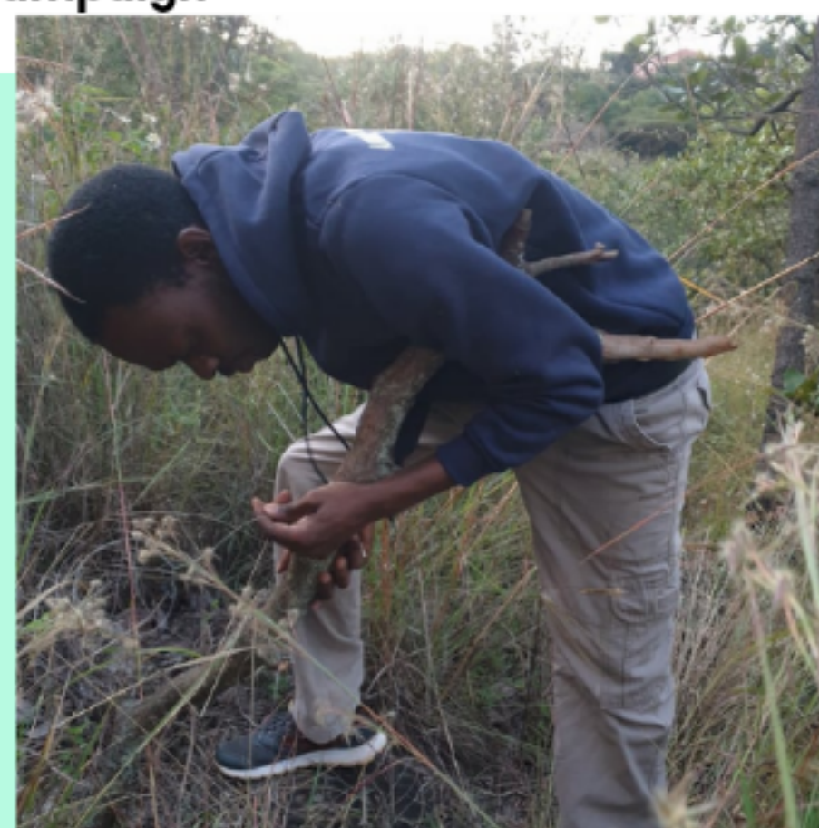
Snare removal campaigns